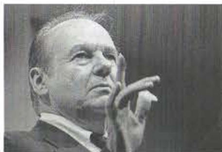
SUSAN SAANDHOLLAND/SPECIAL TO THE CITIZEN-TIMES Bluegrass legend Carter Stanley comes to life in an upcoming performance at N.C. Stage Co.

added over 100 songs to the core repertoire of early bluegrass.